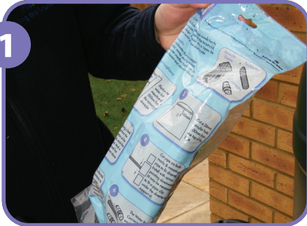
1 Remove items from the pack and put in a safe place and use the pack for guidance.