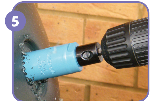
5 Use a hole saw to drill your hole.