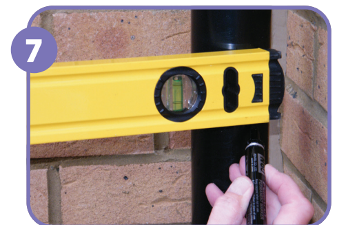
7 Mark a level line from the bottom of the hole on the downpipe.