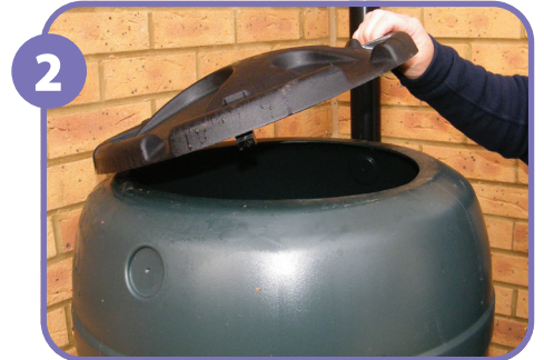
2 Remove the lid from the Water Butt.