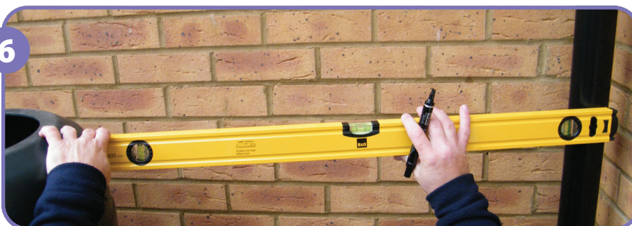
6 Use a level, positioned at the bottom of the your drilled hole.