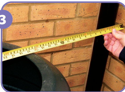
3 Make sure that the water butt is positioned no more than 500mm from the downpipe.