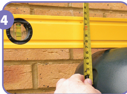
4 Measure 100mm from the top of the butt and mark it.