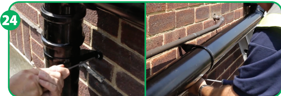
The ventilation pipe open to the outside, should finish at least 900mm above any opening into the building that is within 3 metres of the soil stack.

To view our Waste and Traps installations, please visit www.floplast.co.uk