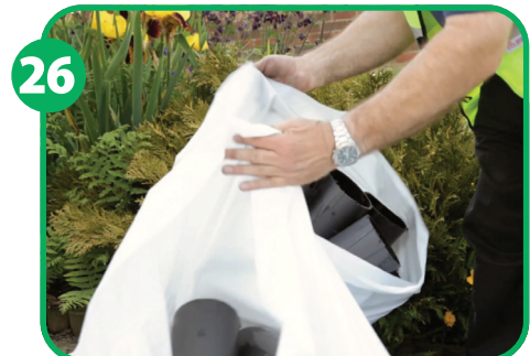
Once your installation is complete, please dispose of old or unwanted items including pipes and fittings in a responsible manner.