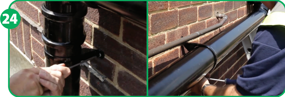
Fix vertical and horizontal pipe or socket brackets.

To view our Waste and Traps installations, please visit www.floplast.co.uk