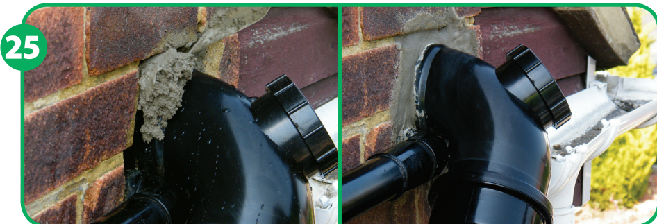
To complete the installation, use a cement mix to make good any holes.