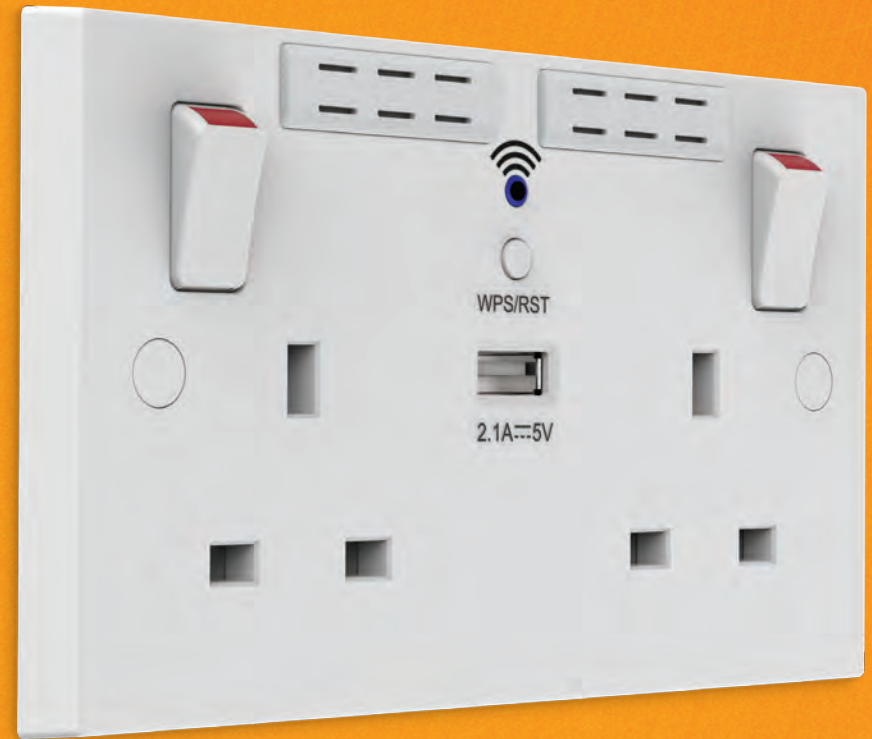
Wi-Fi Socket + USB