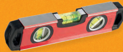
Small Spirit level