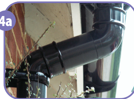
4a Working from the top downwards, install the downpipe. If additional lengths of downpipe are required, join using a socket and pipe clip.