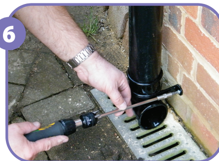
6 Fit the shoe at the bottom of the downpipe so that it directs water into the drain, if required. Secure the joint with a pipe clip.

RECOMMENDED: Secure pipe/socket clips with two 32mm x 6.5mm screws.