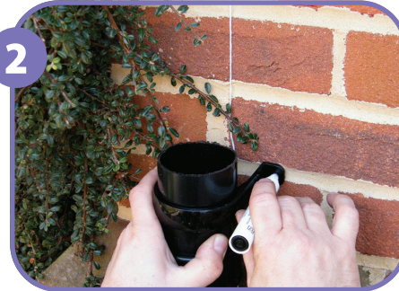
2 Hold a downpipe clip centrally over the line and mark the fixing holes on the wall with a pencil. Repeat down the wall, spacing pipe clips no more than 1.8m apart.