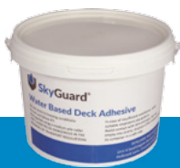
Water Based Deck Adhesive