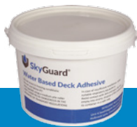
Water Based Deck Adhesive