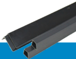
Edge Trims for Larger Roofs