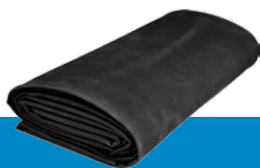
Long Life EPDM Membrane

Once you're all measured up, simply find the best size from our range of Standard Shed Roof Kits. IF IN DOUBT GET THE NEXT SIZE UP! Optional edge trims are available, just be sure to make a note of which edge the water runs off. Custom Kits are also available should you not be able to find a standard kit that meets your requirements.