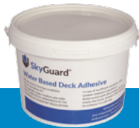
Water Based Deck Adhesive