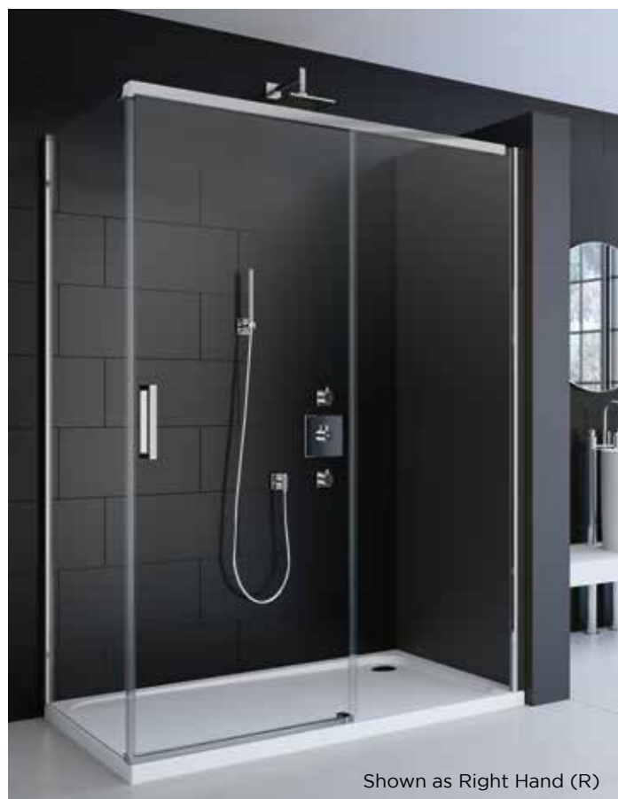
Shown as Right Hand (R)