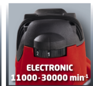
ELECTRONIC 11.000-30.000 min -1