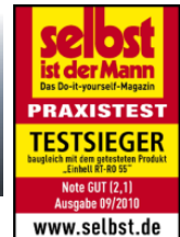
selbst ist der Mann Das Do-it-yourself-Magazin PRAXISTEST TESTSIEGER Ausgabe 07/2010 www.selbst.de