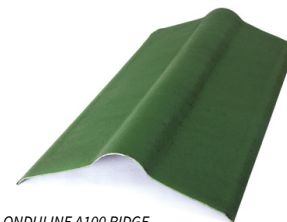
ONDULINE A100 RIDGE

For maximum ventilation, ONDUTISS membranes are the recommended air permeable membrane to use with DURO SX 35 for all timber build structures.