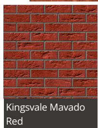
Kingsvale Mavado Red

A stunning, sustainable facing brick, brought to you by Marshalls Bricks & Masonry. This vibrant red facing brick from the innovative Kingsvale range would sit comfortably in both traditional or contemporary designs. Use our brick visualiser tool, located on all of our facing brick pages to help bring your ideas to life.