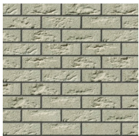
Kingsvale Etton White

Etton White incorporates cool white hues with the innovate creased face texture of the Kingsvale range. This brick would be equally fitting incorporated in traditional or contemporary designs. Learn more about how Marshall's Bricks & Masonry are a supplier of quality, sustainable facing bricks by clicking the link below to our infographic.