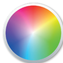
Bespoke colours available on request.