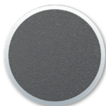
Grey (RAL 7016)