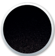
Black (RAL 9005)