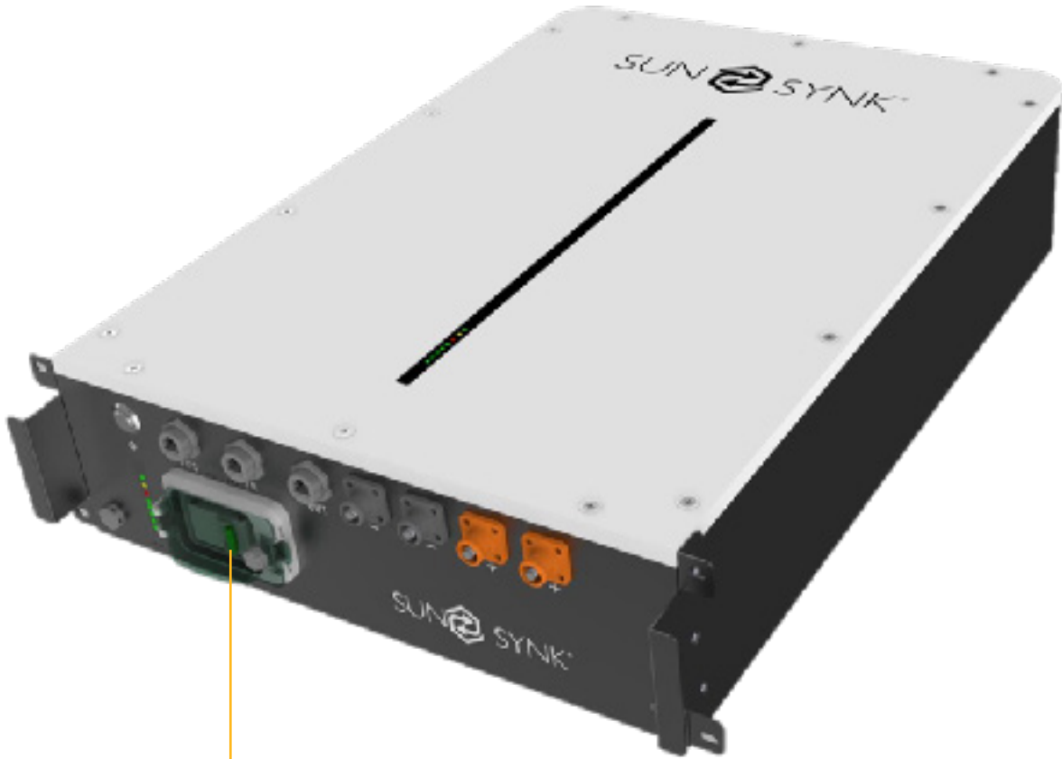
DC 125A Circuit Breaker