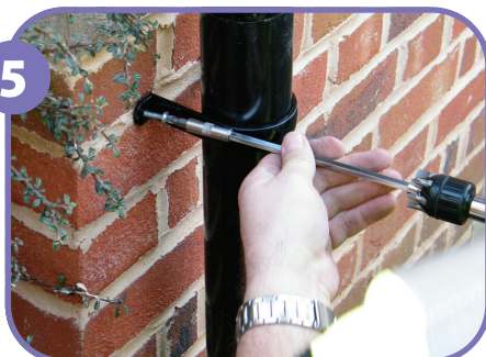
5 Fit the pipe clips to the downpipe and screw them into the wall.