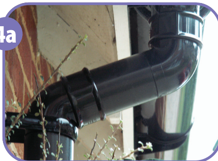
4a Working from the top downwards, install the downpipe. If additional lengths of downpipe are required, join using a socket and pipe clip.