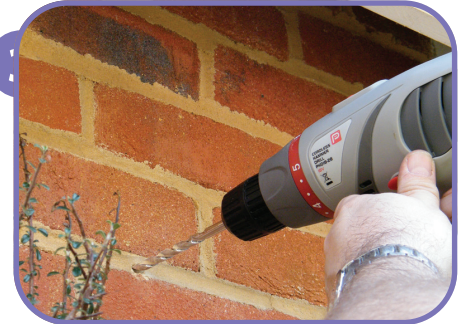
3 Drill the fixing holes.