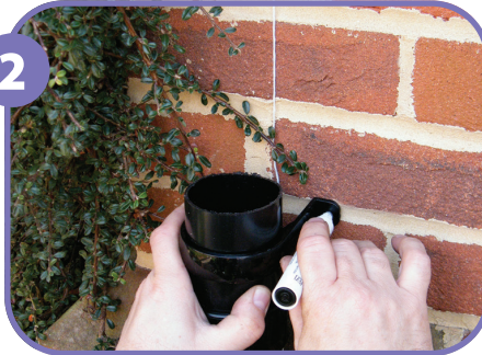
2 Hold a downpipe clip centrally over the line and mark the fixing holes on the wall with a pencil. Repeat down the wall, spacing pipe clips no more than 1.8m apart.