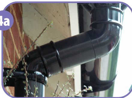
4a Working from the top downwards, install the downpipe. If additional lengths of downpipe are required, join using a socket and pipe clip.