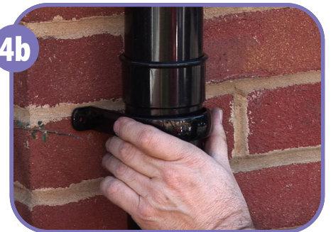
4b Fit the pipe clips to the downpipe and screw them into the wall.