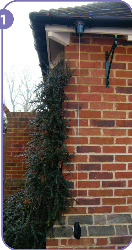
1 Using a plumb line, mark a vertical line on the wall from the outlet to the drain.