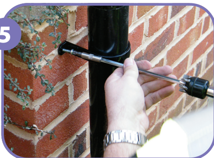
5 Fit the pipe clips to the downpipe and screw them into the wall.