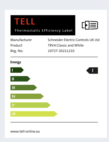
TRV4 Classic and White only

Over and above energy efficiency, the TRV4 sets the standards for design, performance and quality. The TRV4 range includes matching chrome lockshields and pushfit packs to suit most domestic and commercial heating systems.