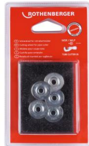
Schneidrad f. TC 35, MSR, 5St. Article: 070188D