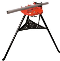
Tripod Uni Workbench TRI-BENCH Article: 70752