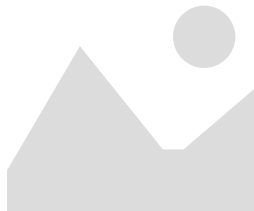
Replacement axle 2 pcs. Minicut 2000/TC 35/42 Article: 70041